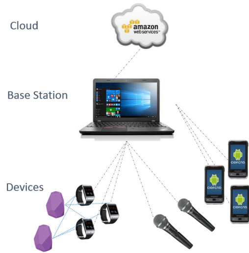
Fig. 1: Major Components of Residential Monitoring Systems

A research-oriented residential monitoring system (RRMS) usually consists of three layers: (i) sensors and actuators continuously collecting data or performing some actions in the